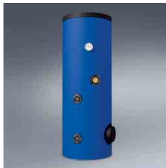
80 / 105 HE-1 Storage Tank