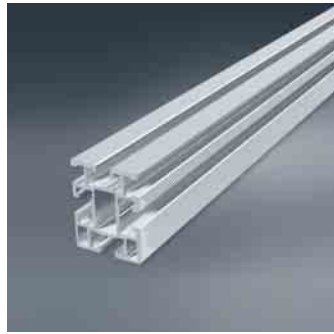
Premium Mounting Kit 2 / 3 (only in Premium Line Packages)