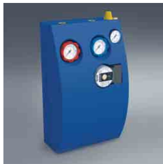
Complete Solar Station (incl. connection pipe)