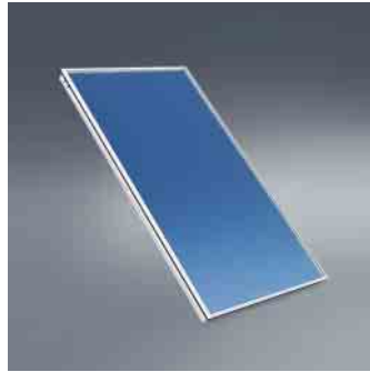
Premium V Collector