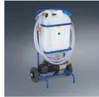
Charging Station (optional)