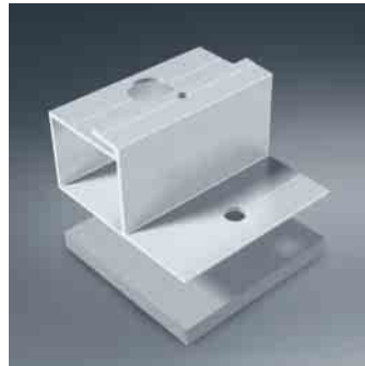
ezFlush Mount Set (only in Slim Line Packages)