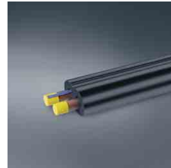
Line Set (optional)