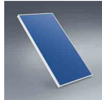
Slim V Collector