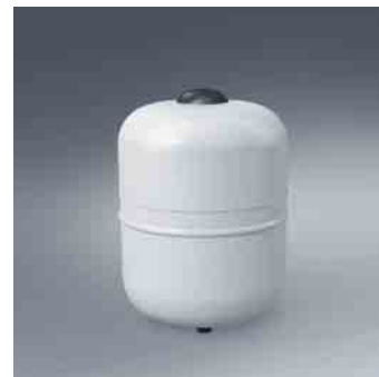
Expansion Tank 4.7 (incl. wall-bracket & flexible pipe)