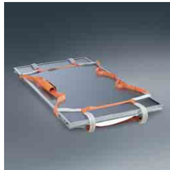
Collector Strap (optional; collector not included)